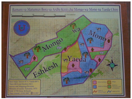
A map of land use zones in Yaeda and Mongo wa Mono villages incorporating designated areas for hunter-gathering

UCRT work in the area extended and recently resulted in obtaining CCROs for 38,000 hectares of Barabaig grazing lands.