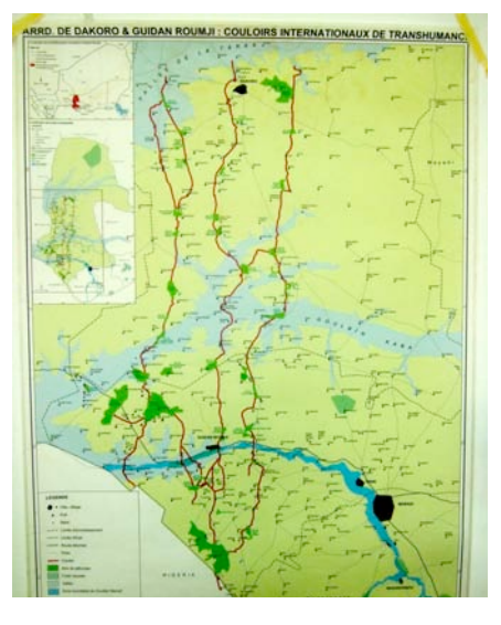
Livestock corridors and grazing areas mapped across the agricultural zone in Niger

How best to do this should be part of welldefined and strategic land use planning processes that seek to optimise drylands production including providing support