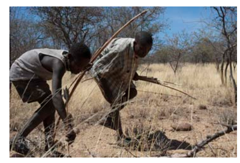
Hadza hunters tracking wild animals for food

The Hadza (or Hadzabe) are one of Tanzania's most unique and threatened communities. Through the centuries they have developed a deep knowledge about the use of natural resources. This has enabled them to survive in a highly challenging arid environment. They depend on natural products such as berries, tubers, baobab fruits, honey and wild animals for food; they do not raise any livestock and they do not cultivate the land.