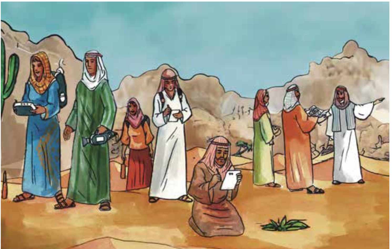
Community mapping its lands and cataloging local biodiversity.

It is best to proactively prepare for potential future FPIC consultations. This section of the guide describes what your community can do to prepare in advance for an FPIC engagement. Taking the time to understand your legal rights, draft your own FPIC protocol, make a plan for how you will address conflicting community opinions throughout an FPIC engagement, and define your own vision for your community's future will help your community be stronger and more prepared if investors arrive seeking your resources.