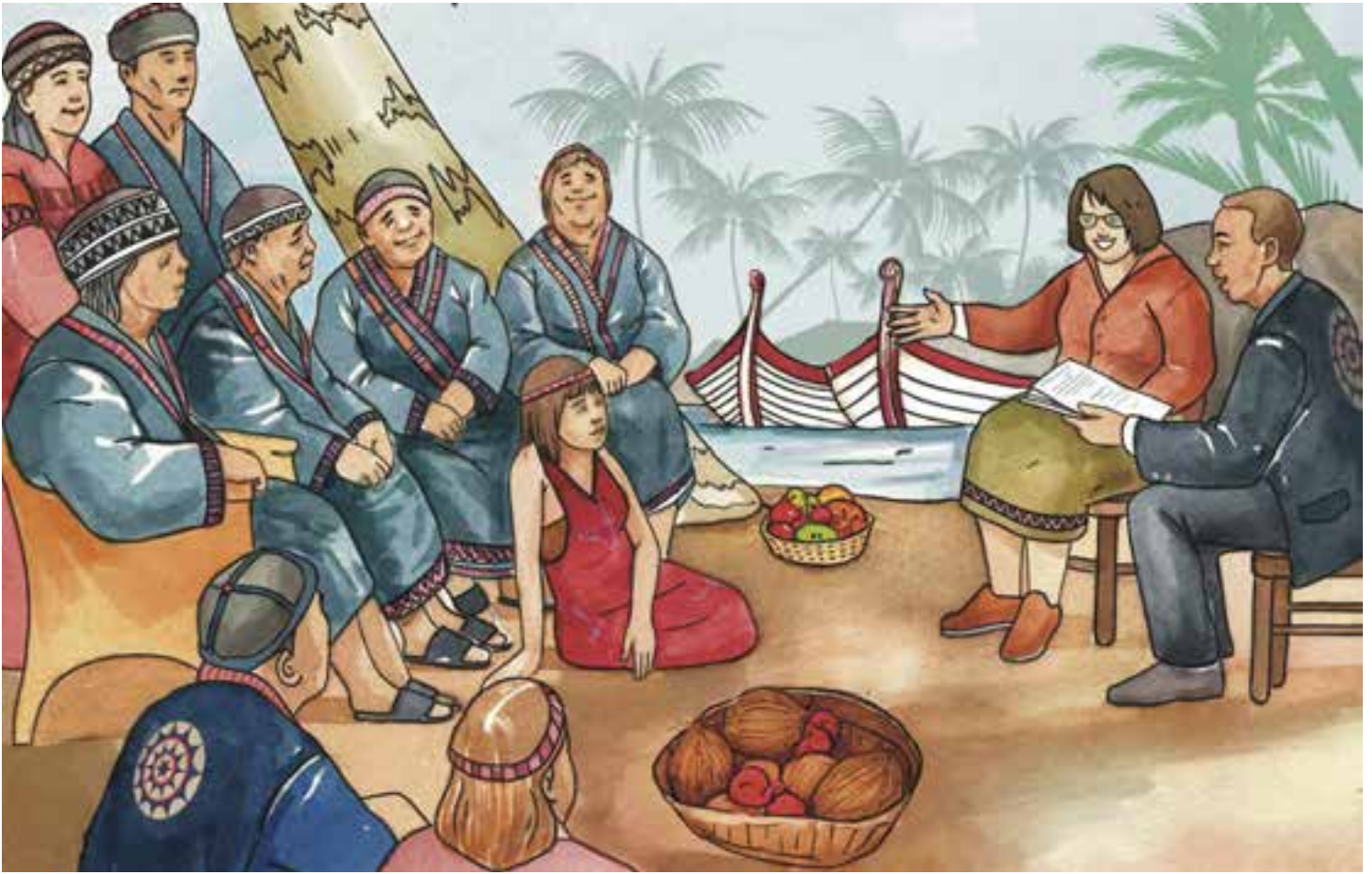
Community members learning about their legal rights to FPIC.