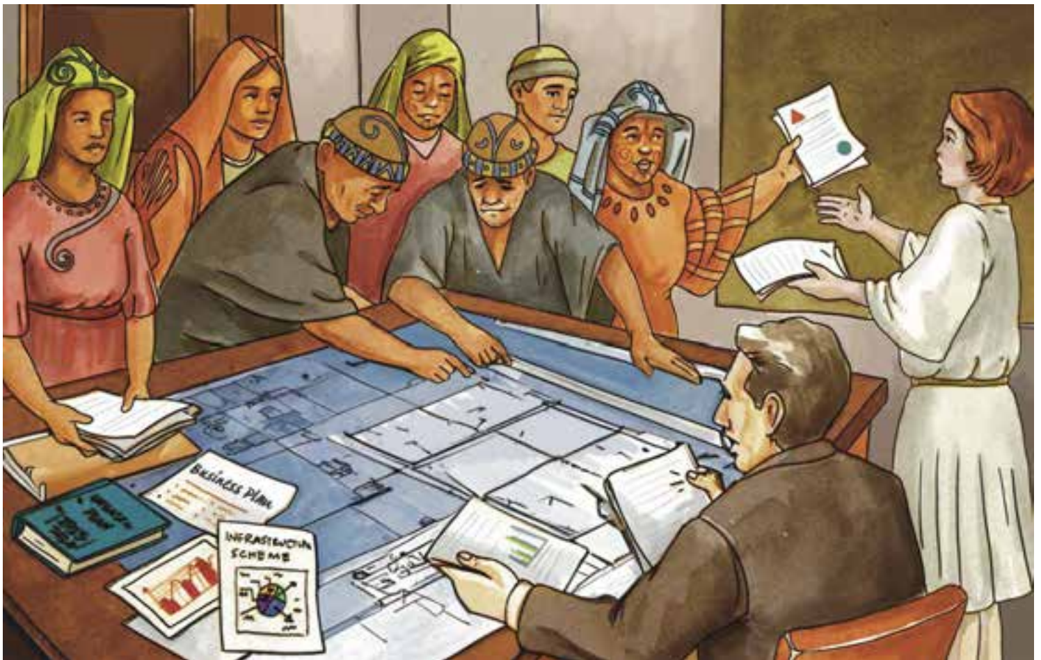
Community leaders and members demanding information, so that they can be fully informed.

If your community has not yet written your own FPIC protocol but are approached by investors and/or government officials seeking resources, you may want to follow the steps outlined in this section as soon as an investor and/or government officials arrive in your community. You can request that the first FPIC consultation meeting take place far enough in the future to allow your community to have the time necessary to prepare, get organized, and be ready.