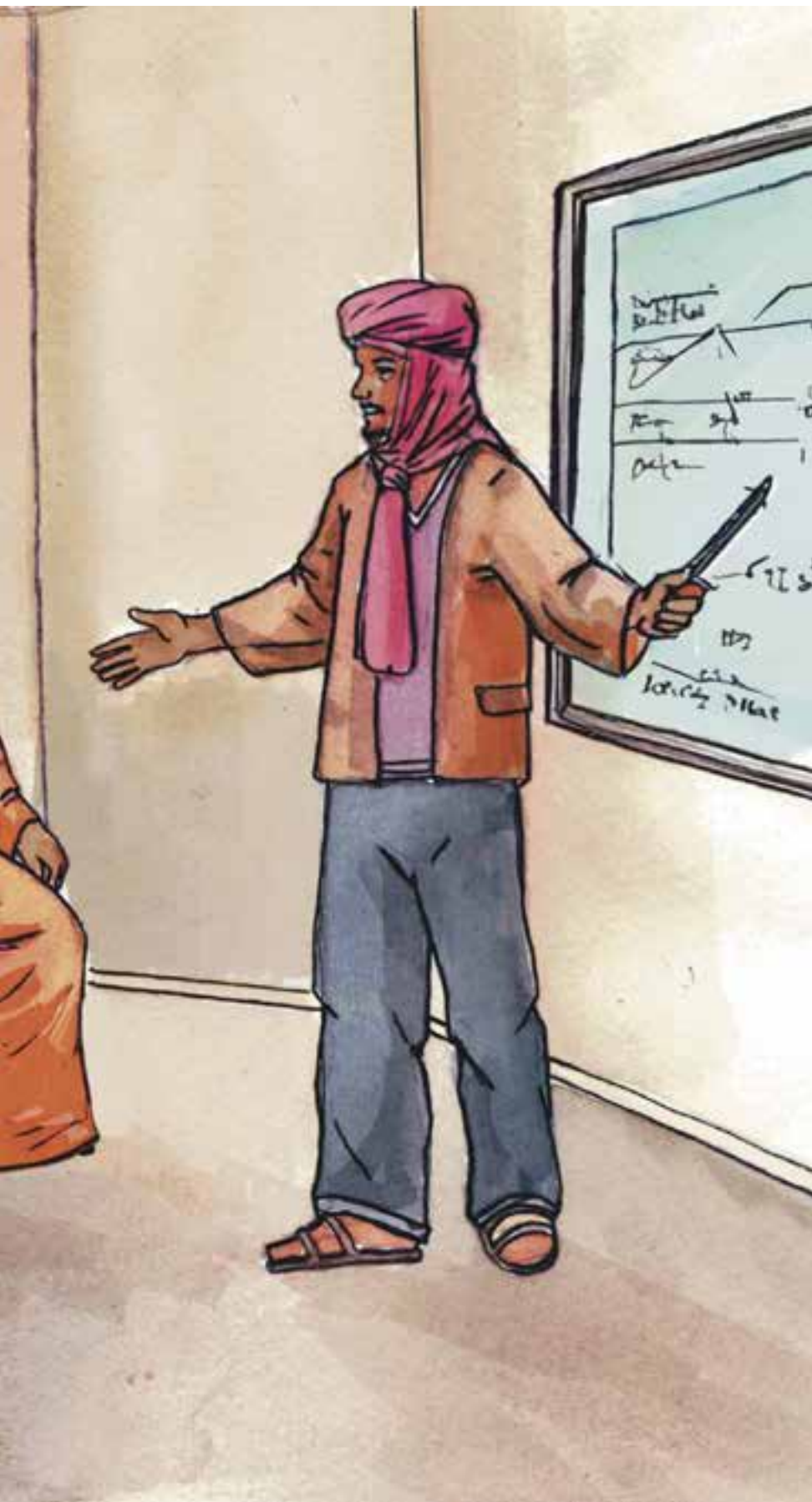
Community learning about a project's investment chain to understand pressure points for advocacy.