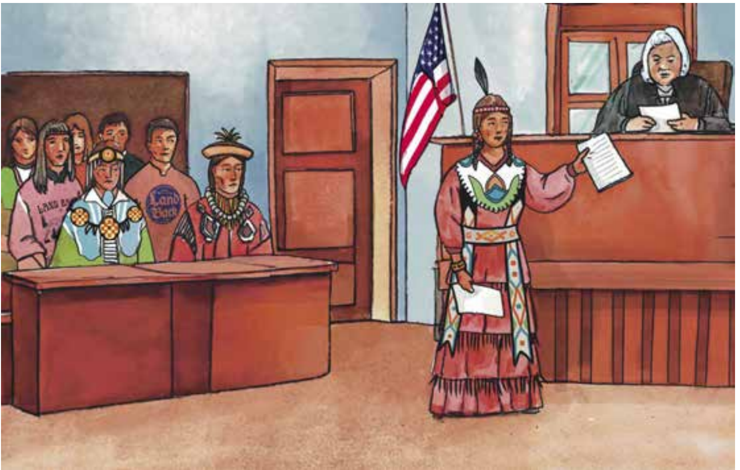
Community challenging a sham FPIC process in court.

Once your community has decided to grant or deny your consent, there are a variety of follow-up actions you may want or need to take. If you refused to consent, you may need to take legal, public, or political action to have your decision respected. If you did grant consent, you must make sure that the terms of your agreement are documented in a legal contract and set out clear monitoring processes, complaints procedures, and dispute resolution strategies . These efforts are briefly described on the following pages.