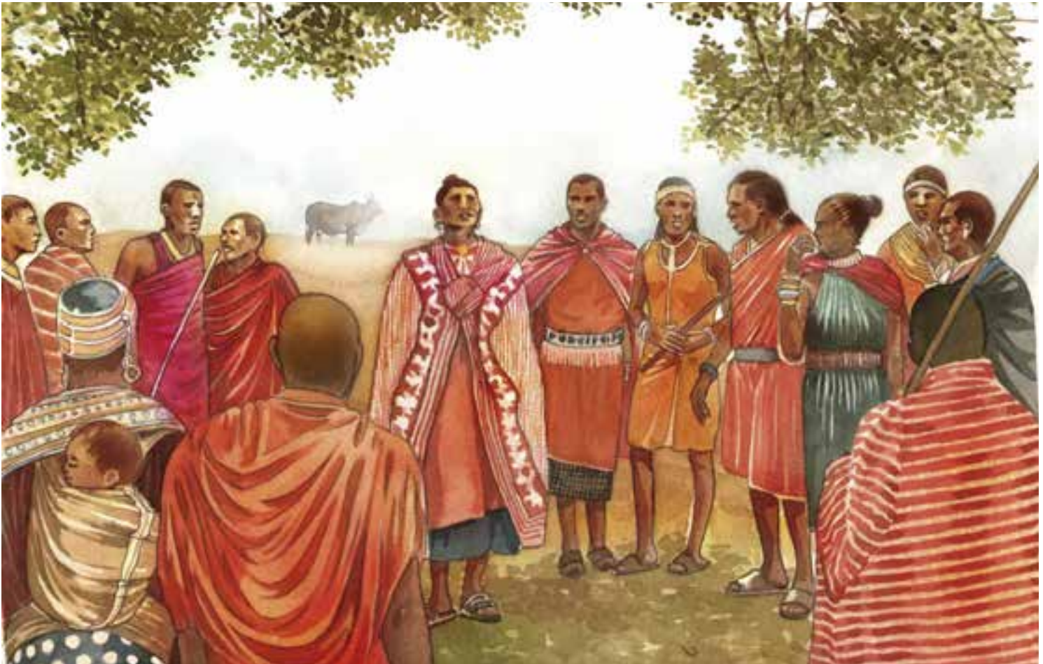
Community meeting to proactively draft their own FPIC protocol.

In response to outside actors' efforts to control FPIC processes, more and more, Indigenous Peoples are proactively drafting their own FPIC protocols that define how they would like to engage with investors and government officials . By clearly setting out how investors and government officials seeking land and resources must proceed, these protocols help to address power and information imbalances, strengthening authentic self-governance, territorial, and cultural rights. Such protocols are externally facing legal instruments that formalize Indigenous Peoples' own laws and desired procedures for FPIC engagements with government and investors.