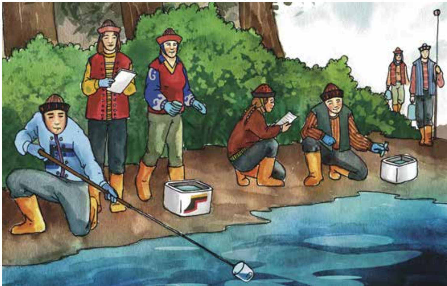
Community monitoring investor compliance with the agreed contract/investment terms.