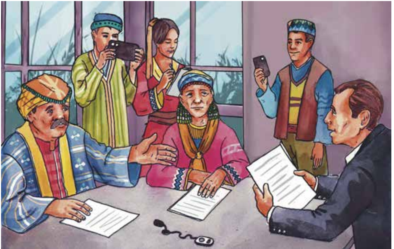
Indigenous youth recording a meeting with potential investors.

Work with advocates and lawyers to find ways of safeguarding your evidence and documentation : there are ways to wipe mobile phones clean in seconds, as well as online sites to safely and securely store your videos and photos.)