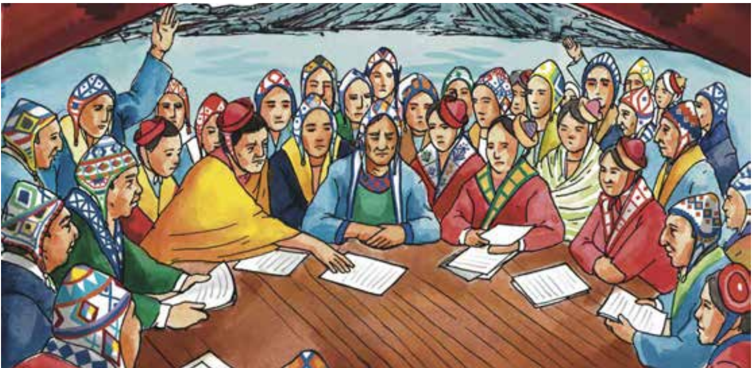
Community reviewing an investor's business plan and discussing whether to grant FPIC or not.

A community's decision to enter into negotiations does not mean that the community promises that an agreement will be reached or has given consent. Negotiation is a process, and the end result depends on whether the parties are able to reach an agreement that both sides are happy with.