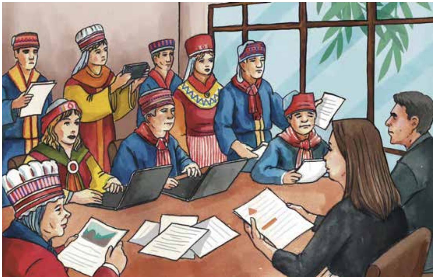
Community working with investors to draft a formal contract outlining the details of a negotiated agreement.