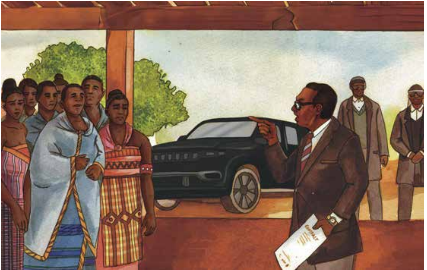
Sham FPIC consultation in which investors are intimidating leaders and community members.