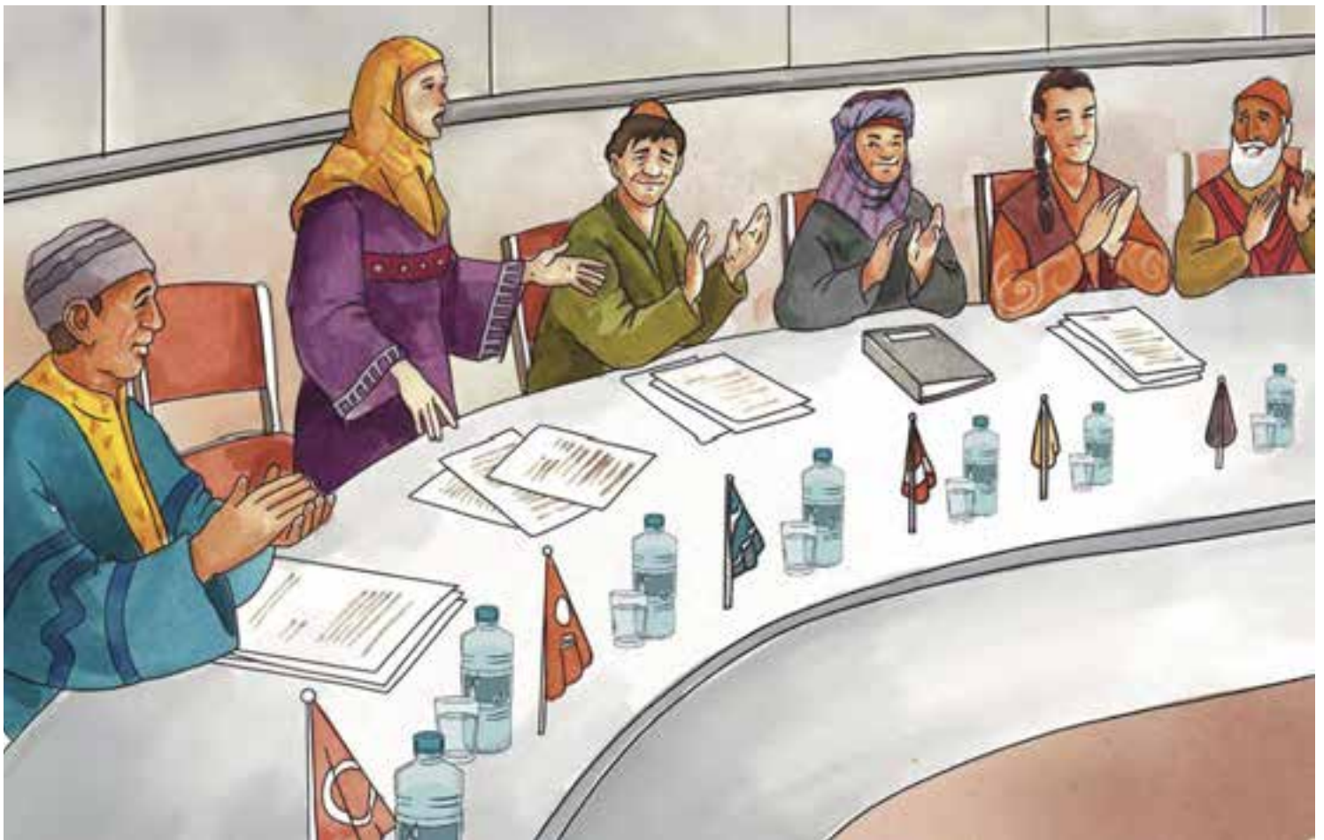
Indigenous Peoples' representatives advocating for stronger FPIC rights at a UN forum.