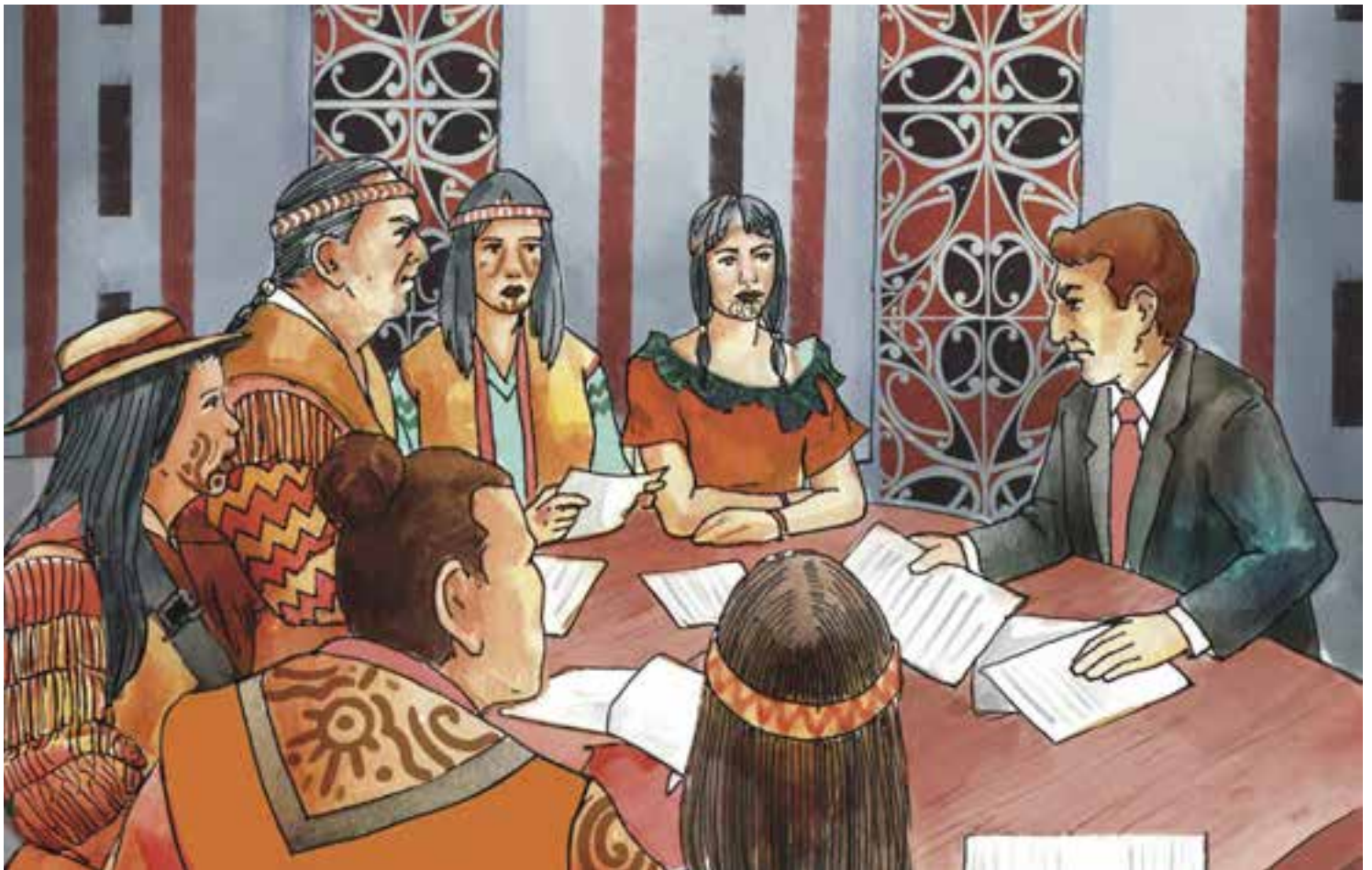
Community initiating a complaint procedure.

3. Investor compliance. Make sure that the contract clearly states what must happen if monitoring exposes environmental destruction, health hazards, human rights abuses, and other negative impacts. The agreement should set out what the investor and/or the government will do in response to data that indicates illegal pollution, a breach of contract, and other violations and challenges.