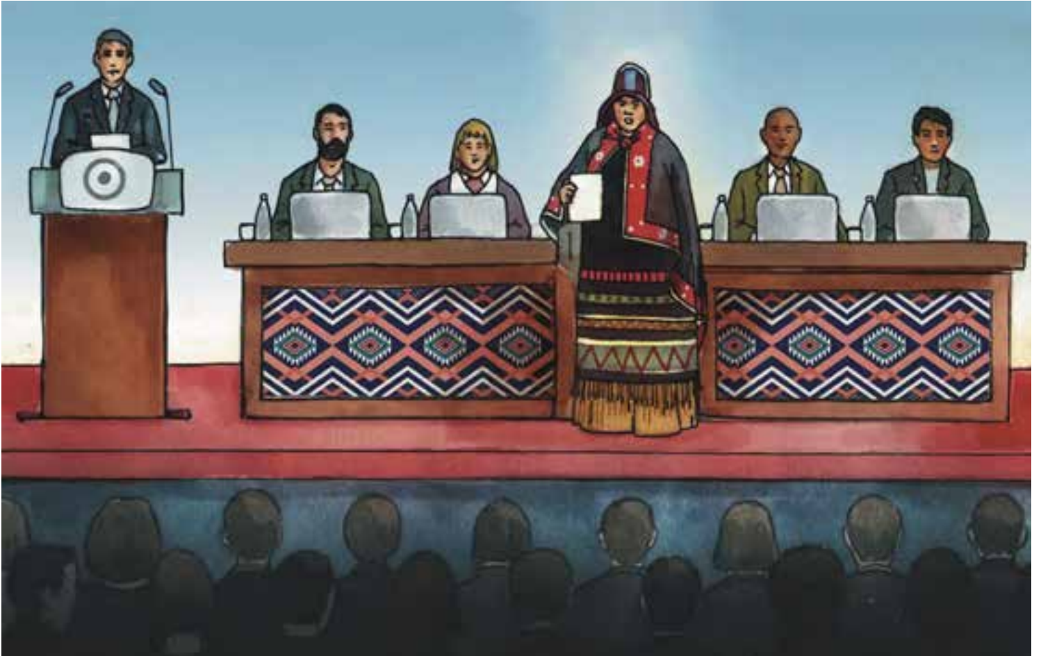
Indigenous leadership presenting FPIC policy proxy resolution on behalf of concerned shareholders at a bank Annual General Meeting.