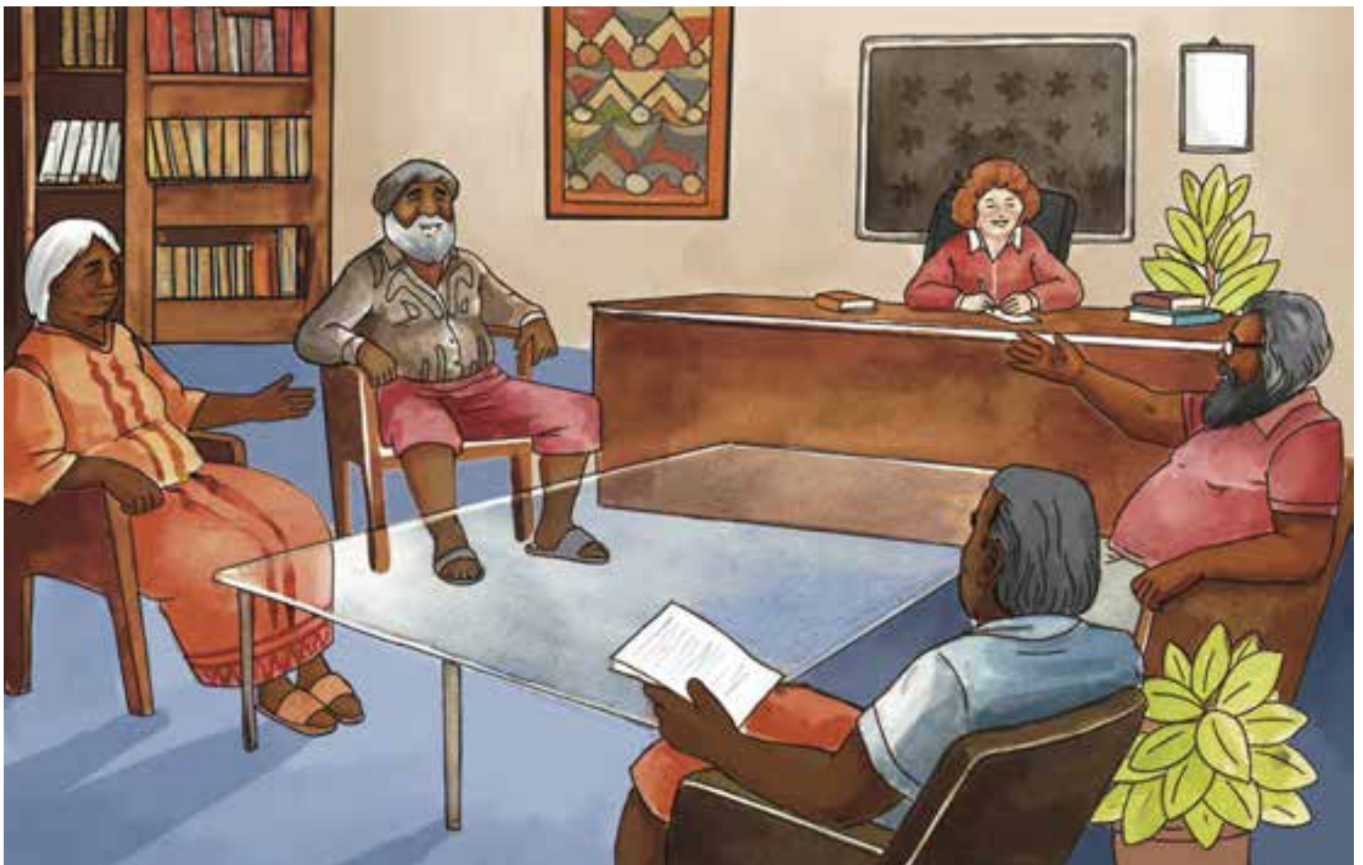
Community members meeting with their own lawyer, presenting their desired outcomes, and seeking legal advice.