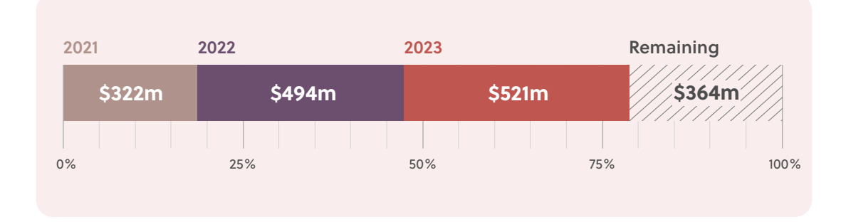
Table 1: 2021–2023 Pledge spending