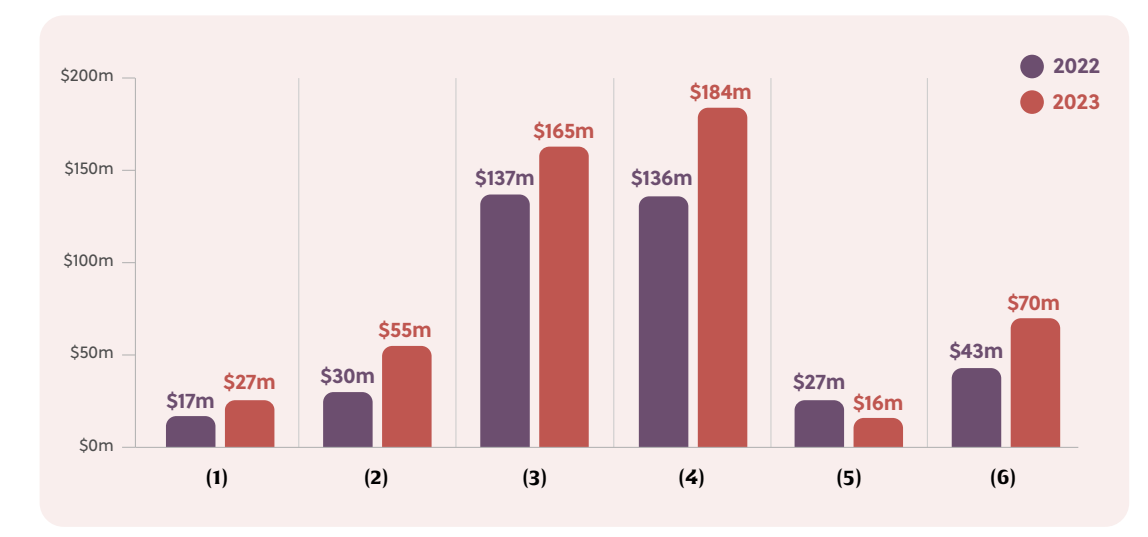
Figure 3: Primary Thematic Area, 2022–2023<sup>22</sup>

As in past years, around two-thirds of Pledge-aligned funding supports either territorial governance and tenure security efforts (theme 3, 32%) or sustainable management and natural resources use (theme 4, 35%). Rights recognition processes (theme 2, 11%) and promoting IP and LC rights in the context of national land and forest tenure reform agendas (theme 1, 5%) continue to receive a smaller portion of the funding—although these shares have increased slightly compared to 2022. Figure 3, below, shows the funding breakdown by primary thematic area.