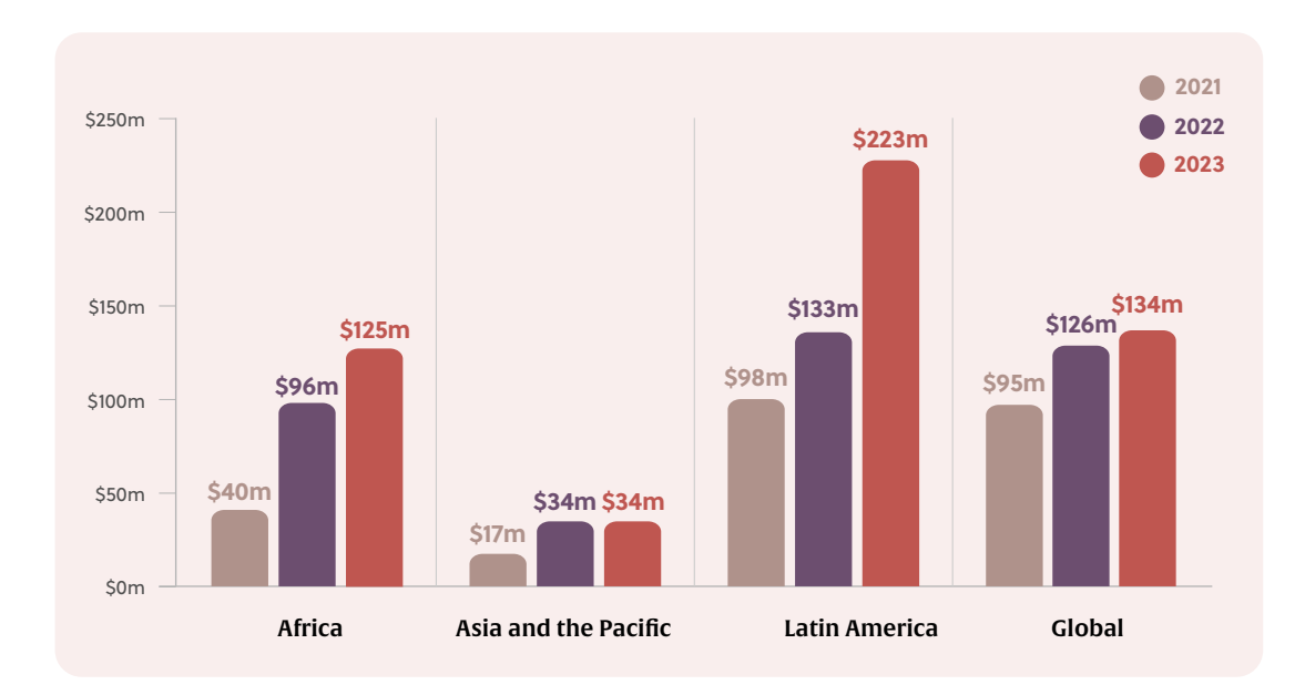
Figure 2: Pledge Spending by Geography, 2021–2023<sup>20</sup>

When examining the number of grants—rather than the amount of funding—going to specific regions, Asia received a somewhat larger share: 15% of non-global grants, compared to 9% of funding. This suggests that the average grant size to Asia is smaller than in other regions and that donors continue to underinvest in the continent. We hope that the recent establishment of several direct funding mechanisms in Asia, including the Nusantara Fund<sup>19</sup> and the Indigenous Peoples of Asia Solidarity Fund (IPAS), will help facilitate increased direct and overall funding in the region.