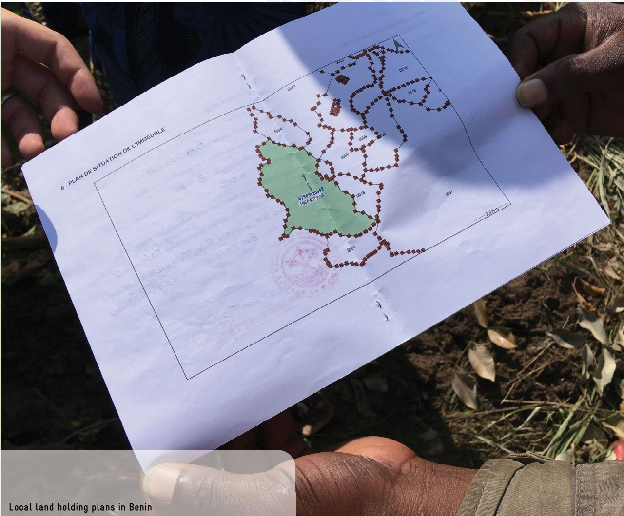
Local land holding plans in Benin