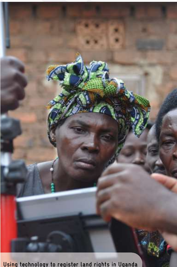
Using technology to register land rights in Uganda

Regularization of informal tenure in informal settlements: Increasing tenure security of squatters in informal settlements to protect them from eviction has a proven track record to improve the livelihoods of the urban poor. Starting in the 1990s, Senegal allocated land use certificates (droits de superficie) to squatters in Senegal that entitled them to apply for titles. Kenya introduced community land trusts to protect squatters from eviction. Experience has shown repeatedly that such tenure security does not require the allocation of individual titles.