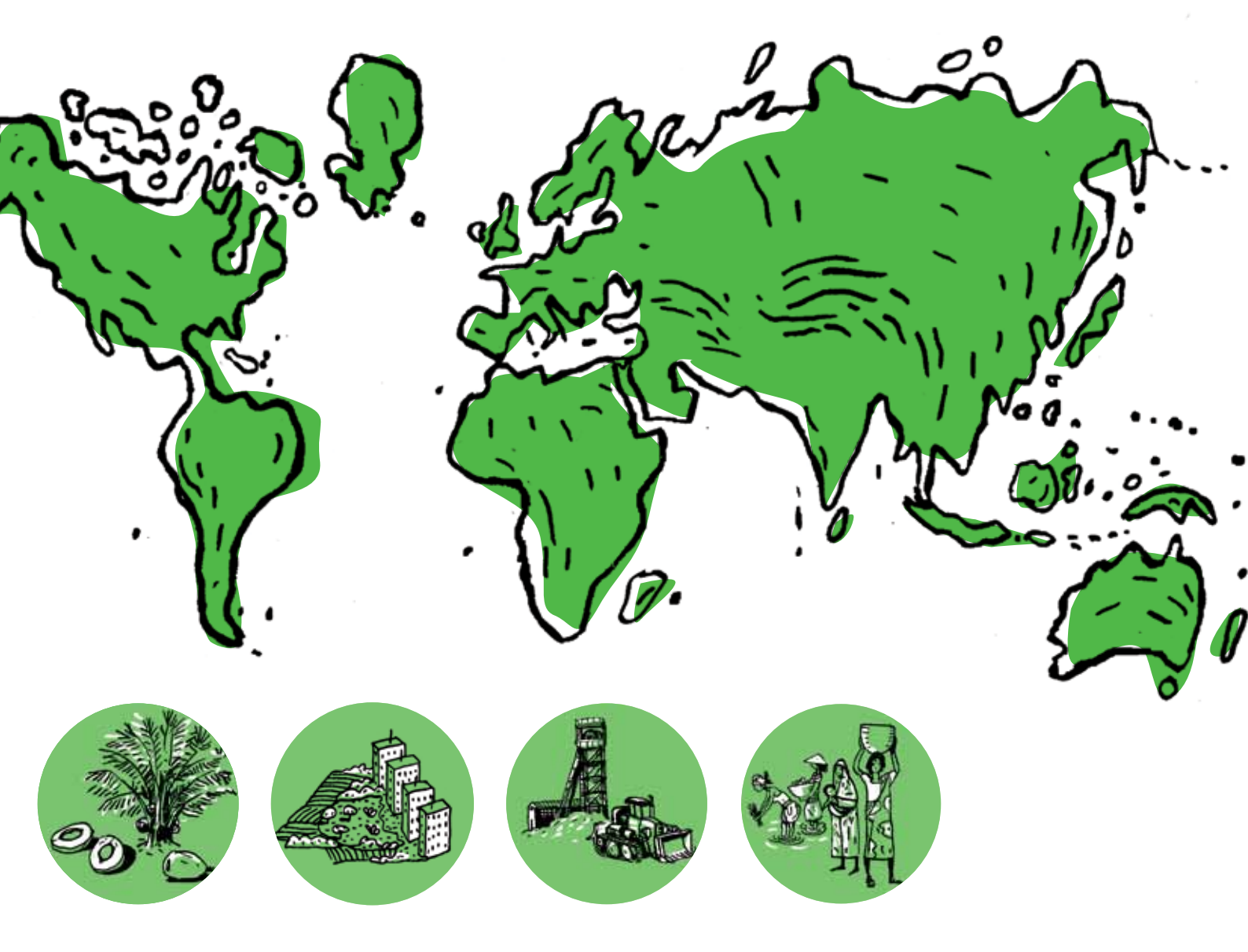
Gendered impacts of commercial pressures on land