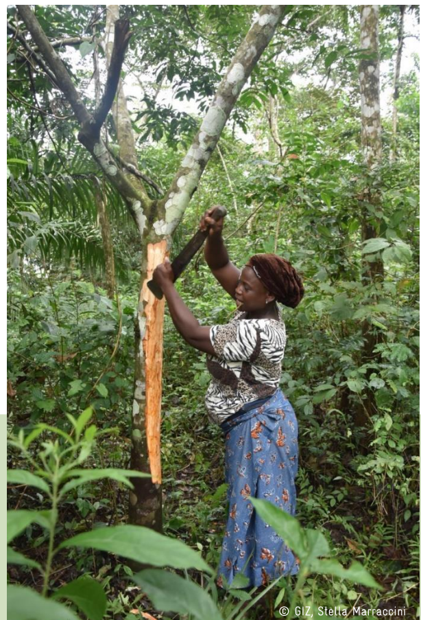
Forest management in Togo that enables the harvest of traditional medicinal plants like the Trichilia Heudelotii

The way in which many restoration projects are conceived is problematic (Edwards et al. 2021), as is their reduction to numeric targets of trees and hectares planted (Turner et al. 2023; Weigant et al. 2022). This is partly tied to their financing by external actors and/or in relation to large global commitments with insufficient attention to important details on the ground (Elias et al. 2021; Weigant et al. 2022). This does not represent good governance or sustainability in forest landscape restoration or address underlying governance problems of degradation. Consequently, local people are not necessarily interested in FLR in the current context (Weigant et al. 2022). Forest landscape restoration needs to be integrated into a much broader and ambitious rural development policy built on the aspirations of local communities, as well as multistakeholder spatial and territorial planning processes (Mansourian and Berrahmouni 2021; Turner et al. 2023). Although these principles are included in FLR guidance documents, such as the Restoration Opportunities Assessment Methodology (IUCN and WRI 2014), AFR100's Voluntary Guidelines (AFR100 2017), and FAO's Standards of Practice to Guide Ecosystem Restoration (Nelson et al. 2024), FLR practitioners struggle to integrate them into on-the-ground actions (Mansourian 2021; Stanturf and Mansourian 2020).