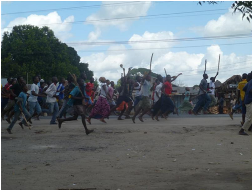
OFFENSIVE DEMONSTRATION HELD IN IKWIRIRI TOWN WHERE PASTORALISTS' HOUSES AND OTHER PROPERTIES WERE DESTROYED AND BURNED