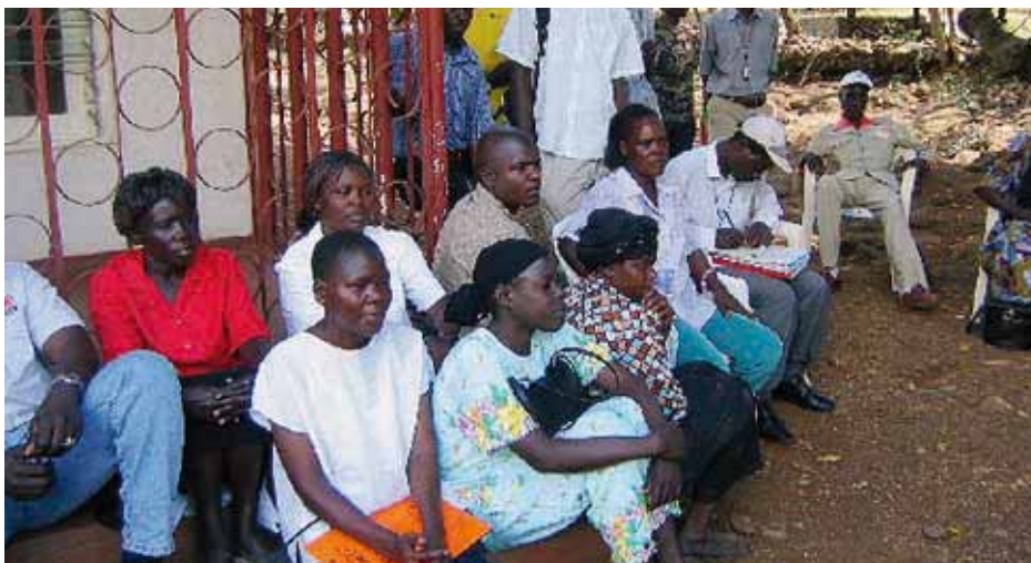
Community meeting in western Kenya

Once the general lines of policy and proposed legislation are in place, a pilot scheme or phased implementation can start. Pilots require careful monitoring of any new institutional arrangements, processes and technical systems so that lessons can be learned before undertaking detailed design, or finalising legal regulations prescribing new administrative procedures. UN-HABITAT has published a guide on 'How to develop a pro-poor-land policy' 12 .