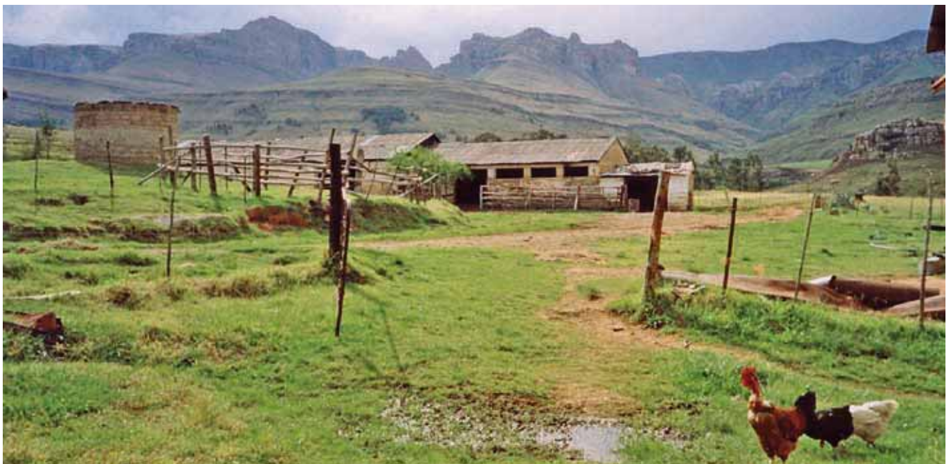
Land reform farm, E. Cape, South Africa.

Land governance must shift its emphasis away from currently dominant technical and managerial approaches to land tenure and administration, and towards approaches based on a better understanding of the political economy of land (e.g., the nature of vested interests and power relations, and their impact on land access and land rights as well as changing uses).