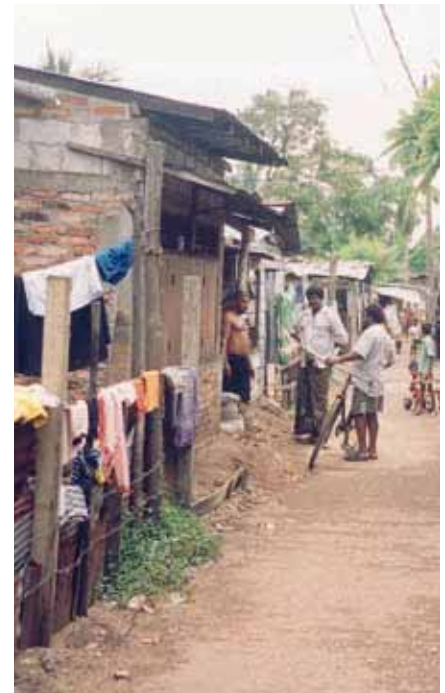
Sri Lanka.