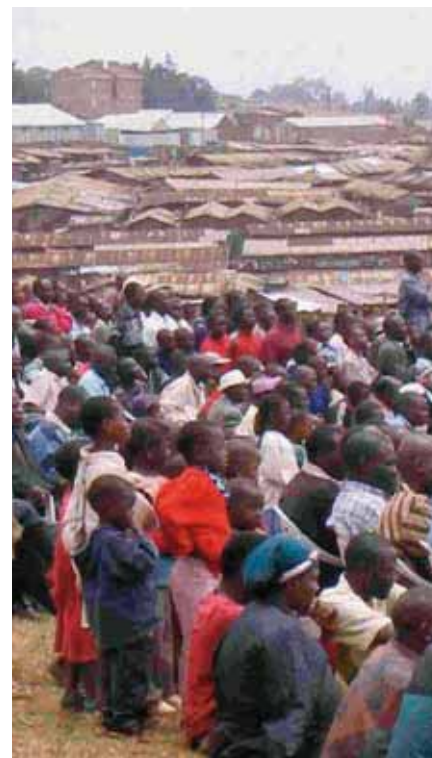
Stakeholders' meeting in Kibera slums, Kenya.

While in the 1990 and 2001 slum estimation all pit latrines were considered not improved, the 2005 slum figures are not directly comparable to 1990 and 2001 figures.