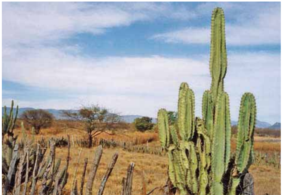
Agro-pastoralist land, NE Brazil.

Bruce JW and Mearns R 2002, Natural resource management and land policy in developing countries: lessons learned and new challenges for the World Bank . Drylands Programme Issues Paper No. 115, IIED London; and Thebaud B 1995 Land tenure, environmental degradation and desertification in Africa: some thoughts based on the Sahelian example . Dryland Programme Issues Paper No. 57. IIED London.