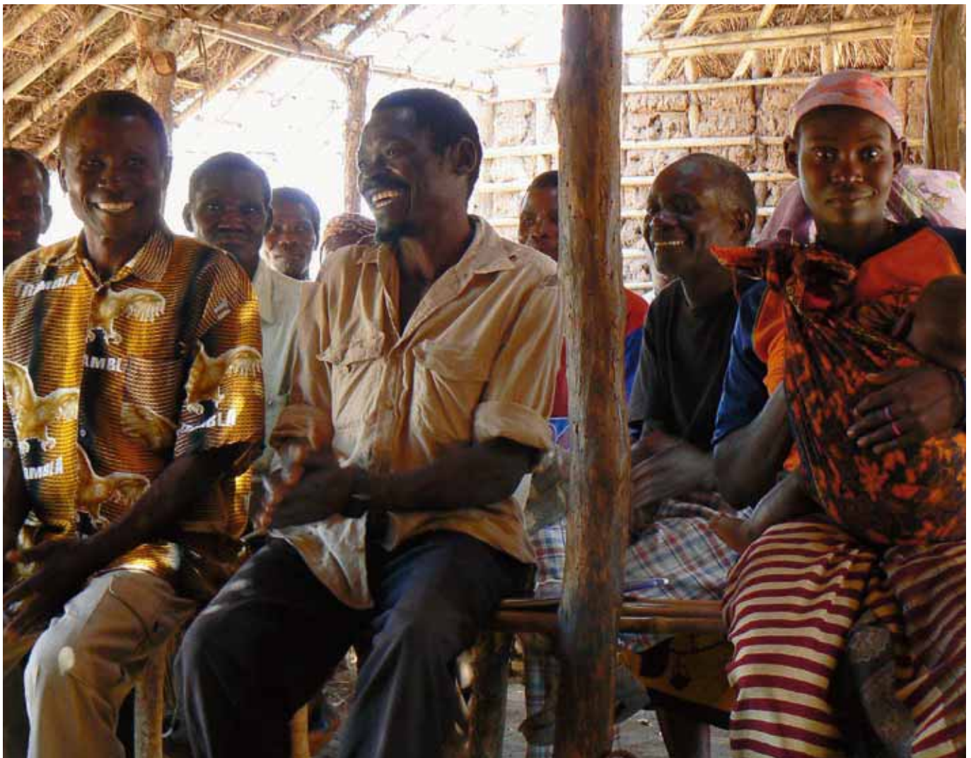
Community development council, Cabo Delgado, Mozambique. Photo © J. Quan. 2007

With land coming under pressure and competition, modern states require land policies to govern access, tenure, use and development. These take the form of land laws , rules and procedures as well as of specialist bodies for land administration . These bodies are in charge of land information systems linking land plots and their occupants or users. Area mapping and plot titling typically result in a cadastre , which ties land information to a parcel map or spatial data base.