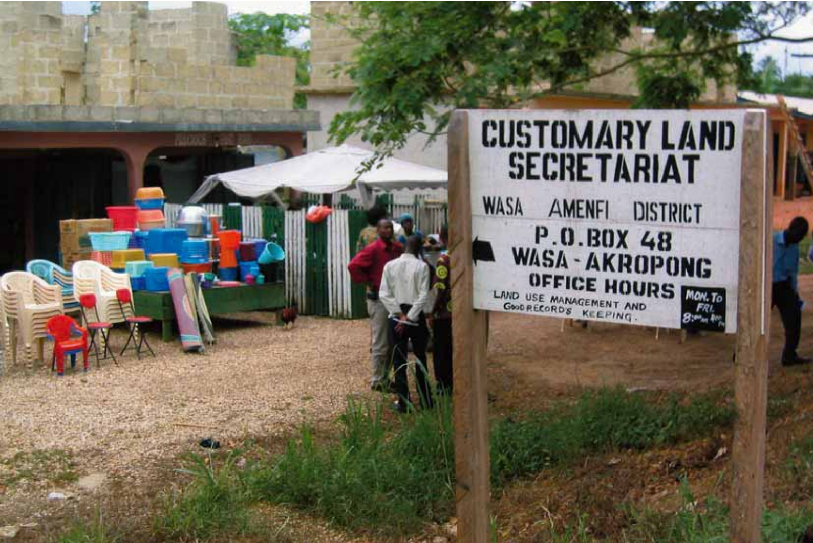
Customary Land Secretariat sign, Wassa Ghana.